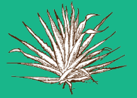
MAGUEY ESPADÍN Agave angustifolia

50.1% Alc.Vol. • MEZCAL ARTESANAL • 100% AGAVE • BLANCO