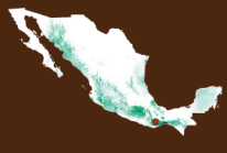
SAN BALTAZAR, OAXACA 'Espadín region'