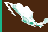
SAN BALTAZAR, OAXACA 'Espadín region'