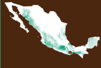
SAN BALTAZAR, OAXACA 'Espadín region'